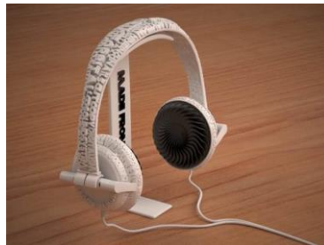
3D printed headphones by B. Garret