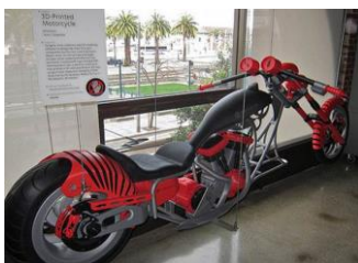
Full size 3D printed polymer motorcycle