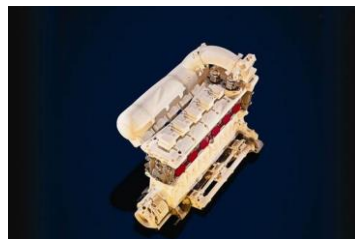
Le Mans race engine built by Aston Martin using 3D printing technology