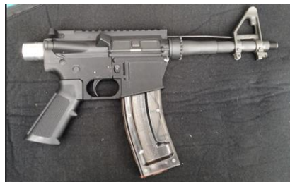
Figure 4: A 3D printed gun

Most of the headlines that 3D printing has produced thus far lie in areas relevant to homeland security. The reader must have already pondered on the capability of an individual to print potentially hazardous material. The simplest case would lie in printing a simple firearm, a case which appears to have already taken place in more than one occasions around the world, as several individuals have already printed and assembled firearm components (Susson 2013). Susson notes that a Texas resident and his nonprofit organization, Defense Distributed, 3D printed the lower receiver portion of an AR-15 rifle and successfully fired off over 600 rounds, while, within days, the man acknowledged that already more than 10,000 people had downloaded the CAD file with the blueprint for the AR-15 lower. So far, US Federal Law does not prevent an individual from manufacturing her own firearm for personal use.