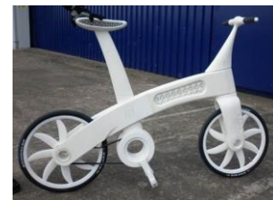
3D printed bicycle by EAD