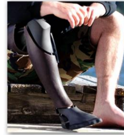
3D prosthetic limbs by S. Summit and K. Trauner