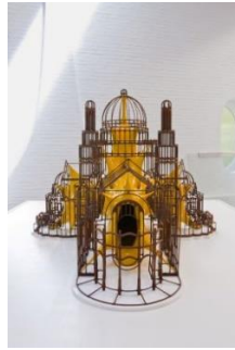
Monumental Architecture with 3D printing by N. Ervinck