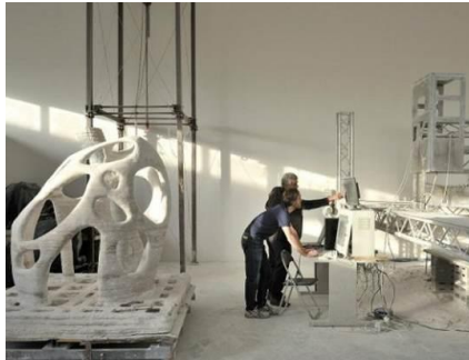
3D printer designed by E. Dini, capable of creating buildings from stone