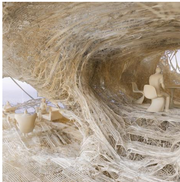
Figure 2: Design of a 3D printed house ( www.dezeen.com )

3D printing could not only offer relief to millions of urban dwellers, but even empower the architect by liberating her from the traditional restrictions of reality. This technology is an additive (formative) rather than a subtractive process. It does not wastefully chip away at existing material - it forms impossible materials in impossible geometries. We are now confronting a future where homes themselves respond naturally to the environment around them, whose energy-efficiency and sustainability are a natural consequence of their form.