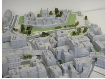
3D print context models by AEC