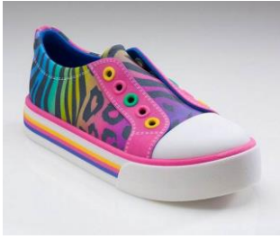
3D printed shoe by Z Corporation