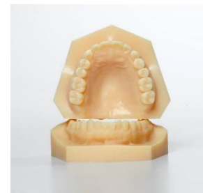
3D printed models of dental parts by Glidewell Labs