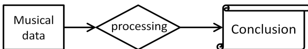
Figure 1. An abstract model of an MIR process

Accordingly, we assume that one of the key generic processes taking place during most of the complex MIR research activities is partitioned to two entities, (a) the input data and (b) the induced result of a processing stage, as shown in the flow diagram of Figure 1.