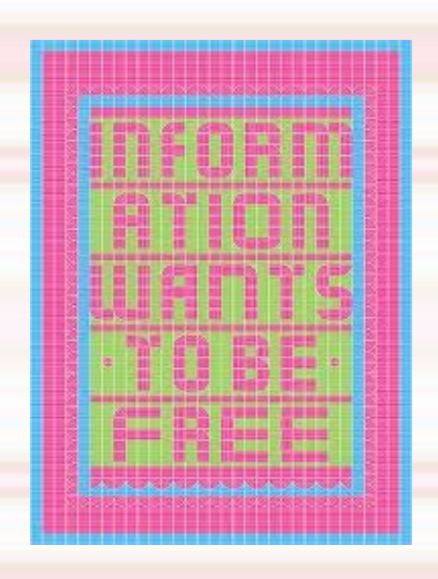
Graphics by mico.toledo